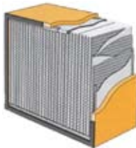
Fig 5. Separator Type