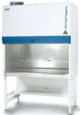
Fig 2. Class II Type B2

In the Class II Type B2 cabinet all inflow and downflow air is exhausted after HEPA filtration to the external environment without recirculation within the cabinet. Type B2 cabinets are suitable for work with toxic chemicals employed as an adjunct to microbiological processes under all circumstances since no re-circulation occurs. In theory, Type B2 cabinets may be considered to be the safest of all Class II biological safety cabinets since the total exhaust feature acts as a fail-safe in the event that the downflow and / or exhaust HEPA filtration systems cease to function normally. However, Class II Type B2 cabinets are, in practice, difficult to install, balance and maintain.