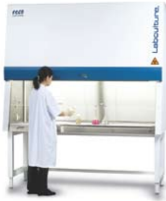
Fig 1. Class II Type A2 BSC