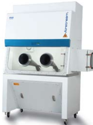
Fig 3. Class III BSC