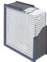
Fig 6. Separatorless Type

HEPA/ ULPA filters are designed to remove a broad range of airborne contaminants, including: